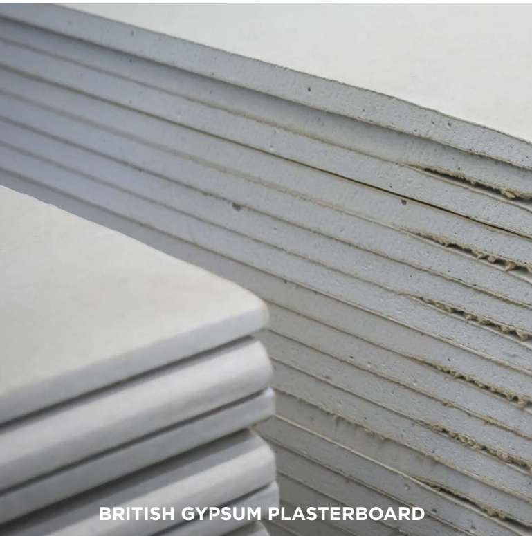
BRITISH GYPSUM PLASTERBOARD